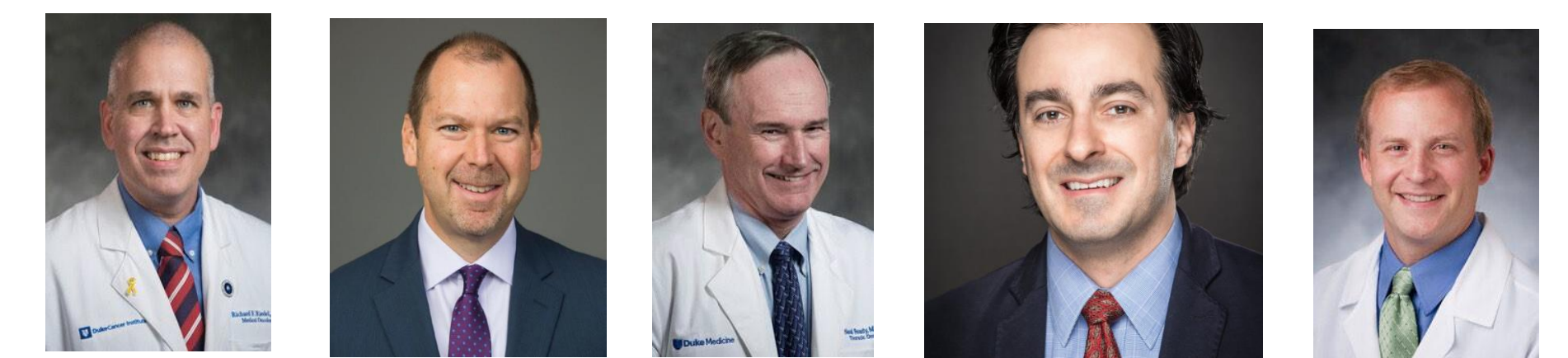
DCI PRMC/CRTEC Faculty Mentors

This program is ideal for future academic oncologists, including medical, radiation, surgical, and pathology fellows or residents or non-physician trainees who will be conducting clinical research involving patients with cancer.