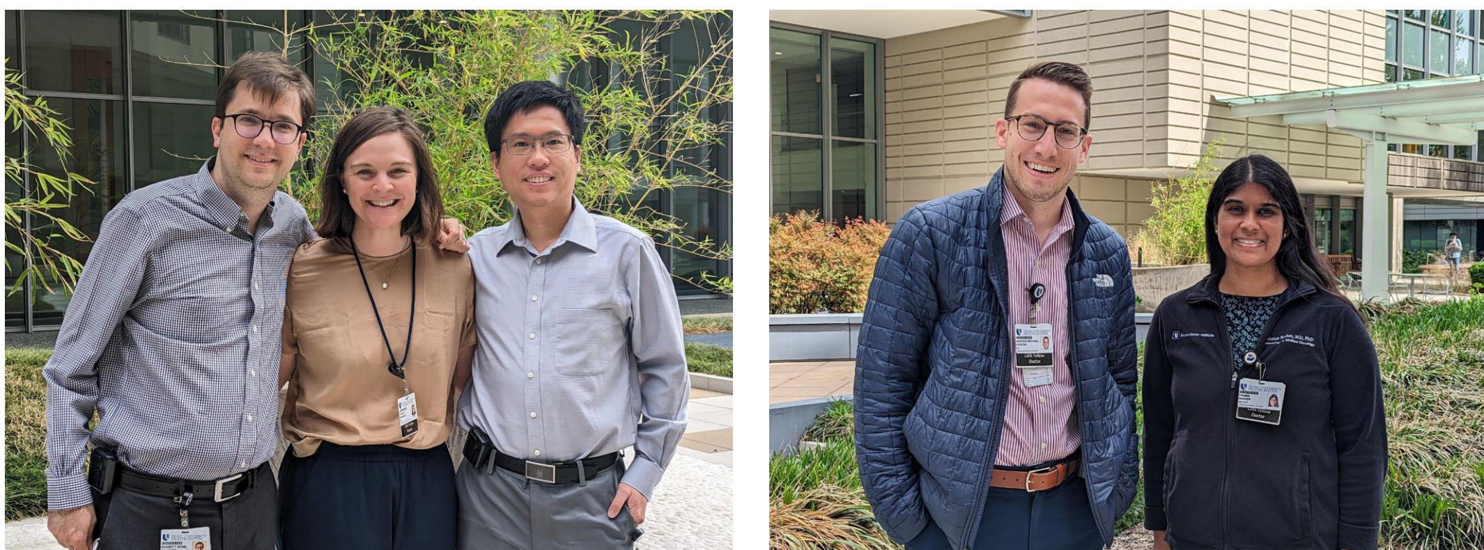
DCI PRMC/CRTEC Fellows