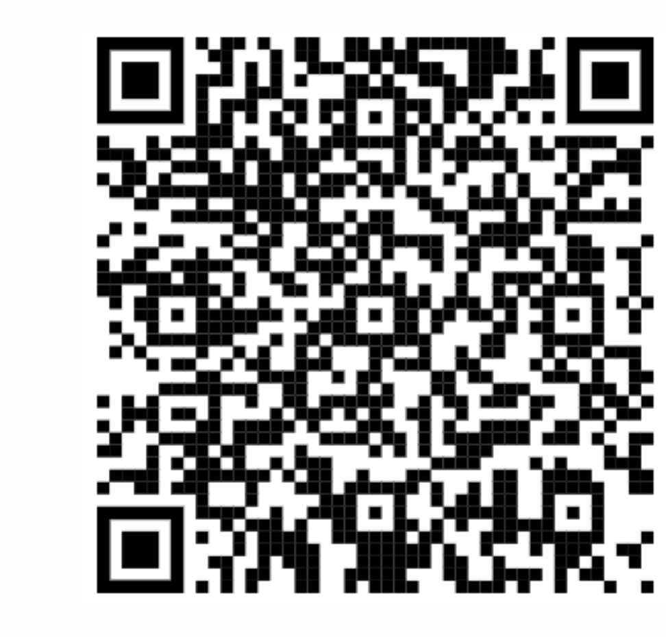
Request a pdf of this poster by email using this QR code.