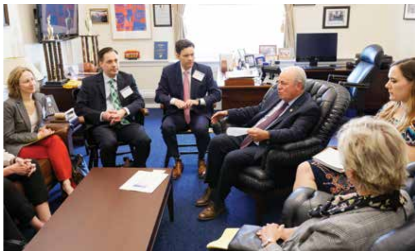
Rep. Mike Doyle (D-PA), third from right, meets with UPMC Hillman Cancer Center advocates.