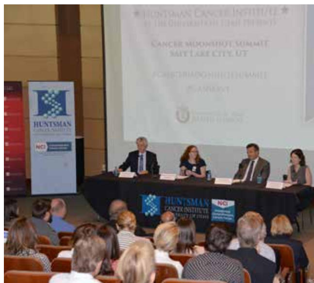
Regional Cancer Moonshot Summits convened across the country, including summits at the University of Illinois Cancer Center, in Chicago (left), and the Huntsman Cancer Institute at the University of Utah, in Salt Lake City (above).