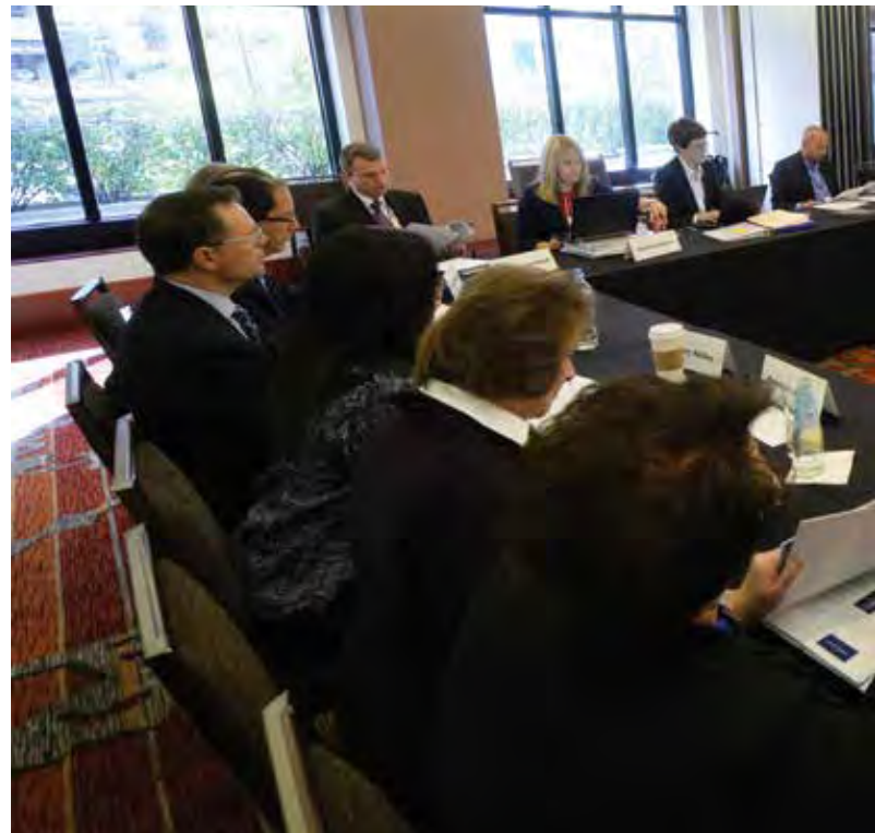
AACI Corporate Roundtable members meet with AACI leadership during the 2016 AACI/CCAF Annual Meeting.

The AACI Corporate Roundtable met twice in 2016—in July at the AACI Clinical Research Initiative (CRI) meeting and in October at the AACI/CCAF Annual Meeting.