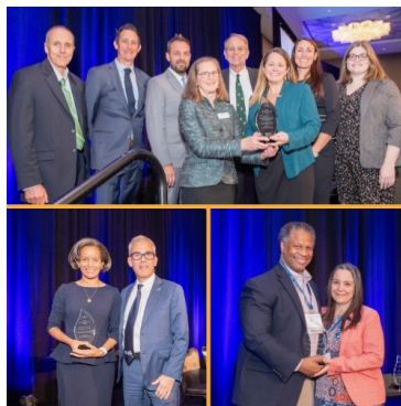
Pictured, clockwise from top: 2024 recipients of AACI's Champion for Cures, Distinguished Scientist, and Cancer Health Equity awards

AACI members are invited to submit nominations for the 2025 Cancer Health Equity and Champion for Cures awards. The submission deadline for both awards is Friday, May 2 . Any faculty and staff at an AACI member institution may submit a nomination for one or both awards. Recipients will be selected from the slate of nominees by AACI's Board of Directors. Read More